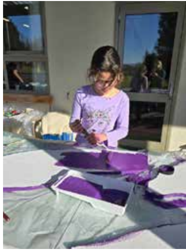
Hard at work preparing our outdoor art installation.