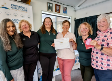
A photo taken after the prizegiving shows the winning team receiving their Goltique voucher for the 2025 title.

The Tarras Women's team has claimed the 2025 Central Otago Inter-club Golf Competition, which ran monthly from February to November. The team secured the title by finishing three strokes ahead of Wanaka, with Millbrook taking third place.